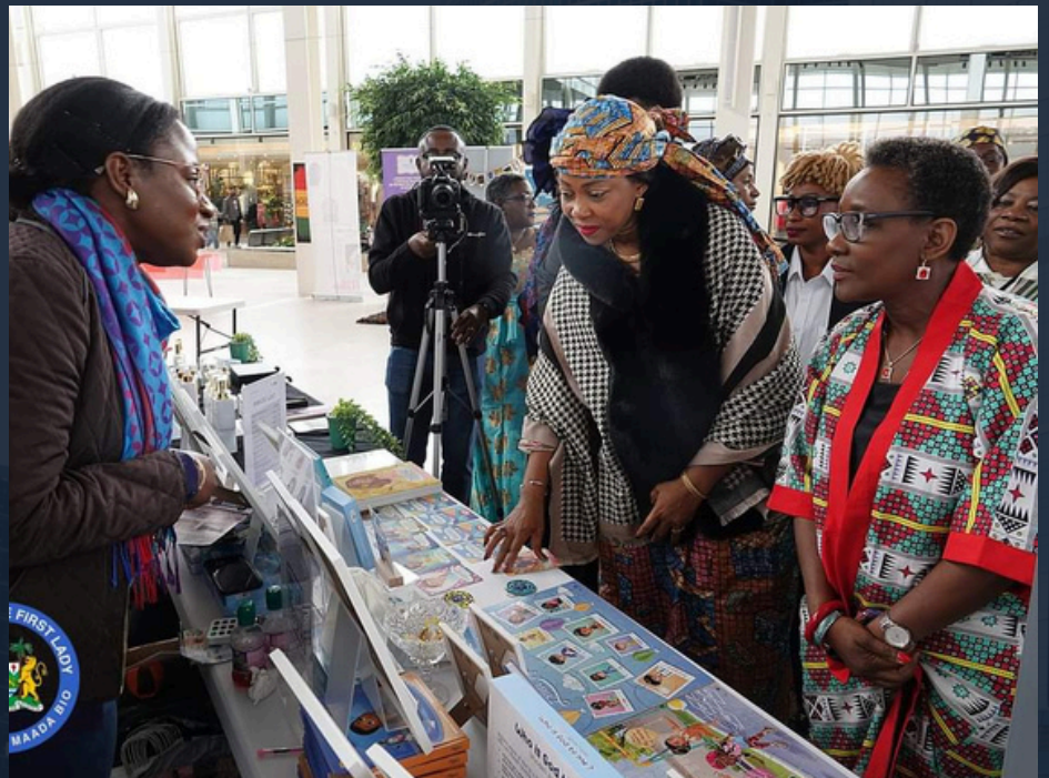
2024 Special Guest Her Excellency Fatima Maada-Bio First Lady of the Republic of Sierra Leone